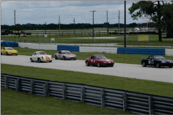
Driver School students exiting Tower Turn.