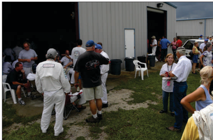
July Driver School Social.