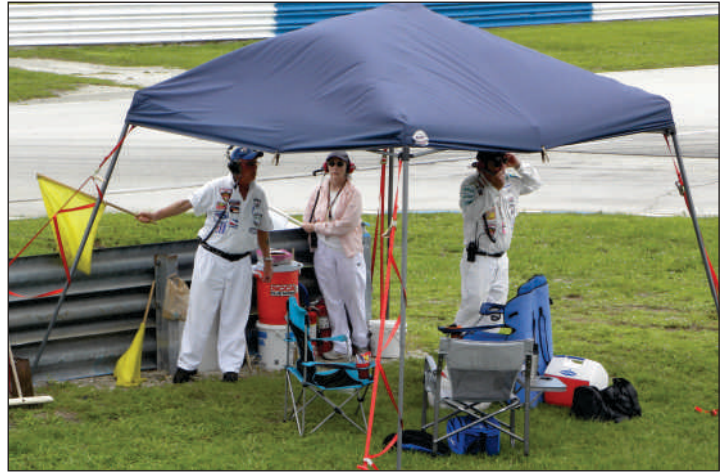
Turn 5 workers display yellow during School 5 Lap race.