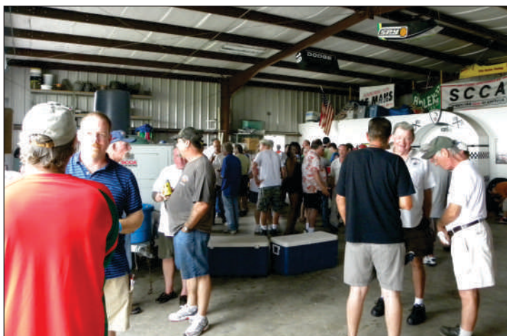
July Driver School Social.