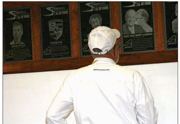
One of the CFR Staff peruses the Building's Wall of Fame