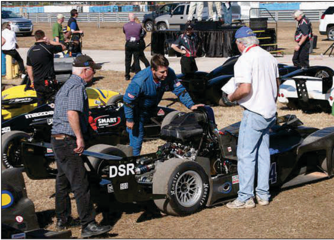
Post Race Impound