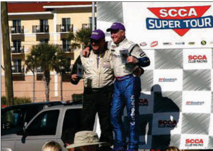
These Guys must be best buds off the track (unless that's a hammerlock)