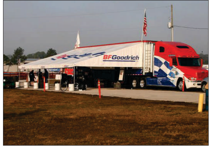
The BFG Super Hauler