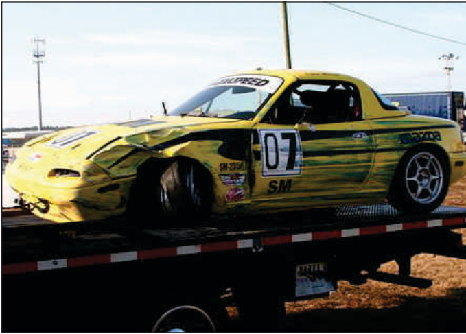
This one seemed to get the brunt of the damage