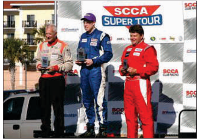
Quite a colorful group here