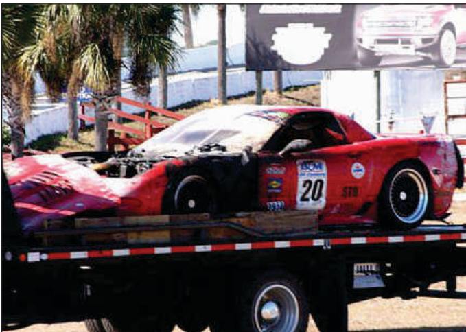
The result of a near catastrophic fire for Russ Snow in Turn 17