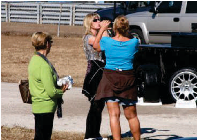
Even the spectators got in on the bubbly