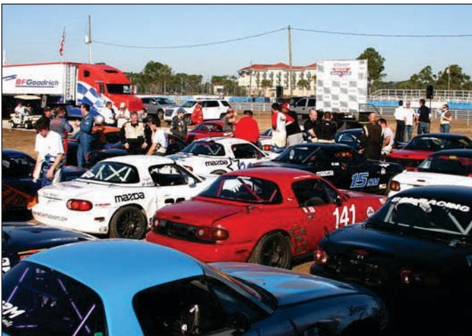
Spec Miata post race impound on Sunday