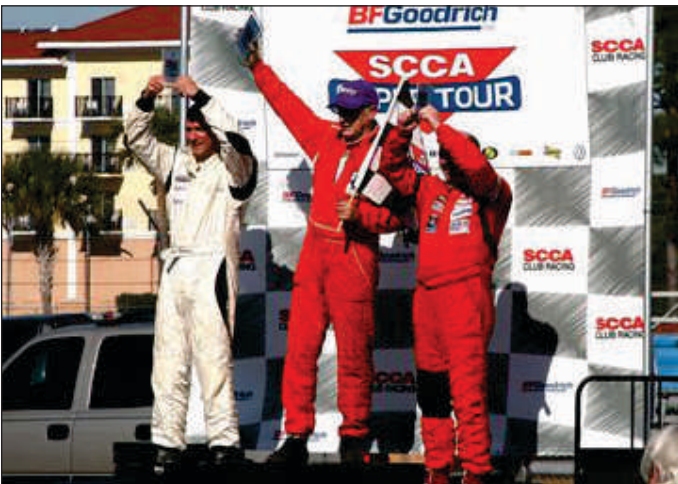
Another happy trio for their Class wins