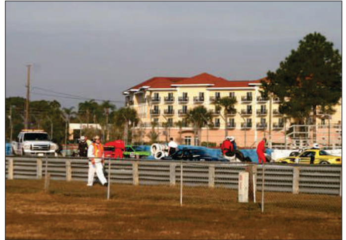
A Spec Miata melee in Turn 17A, 4 cars