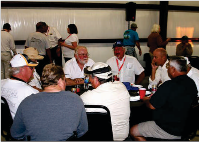
It looks like a good time was had by all especially the Tech Crew