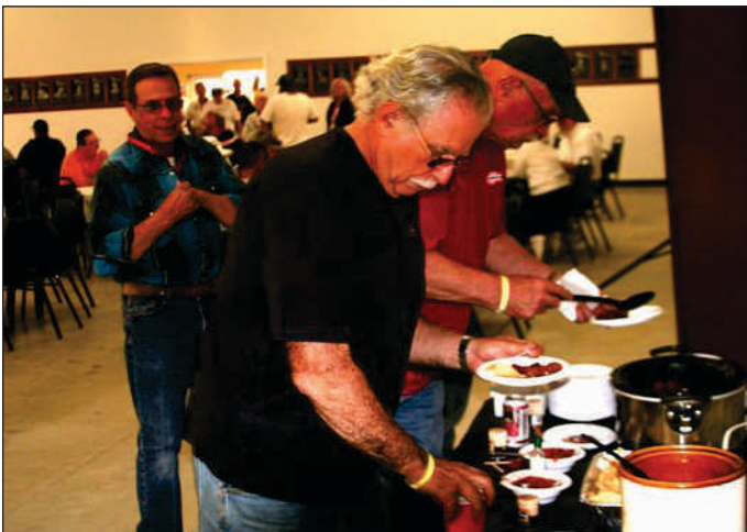
Plenty of good grub at the social held in the Legends Bldg. for the first time