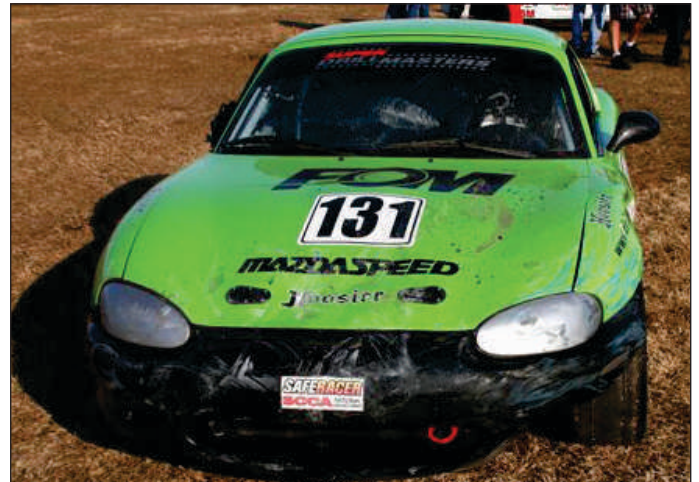
Another participant in the damage