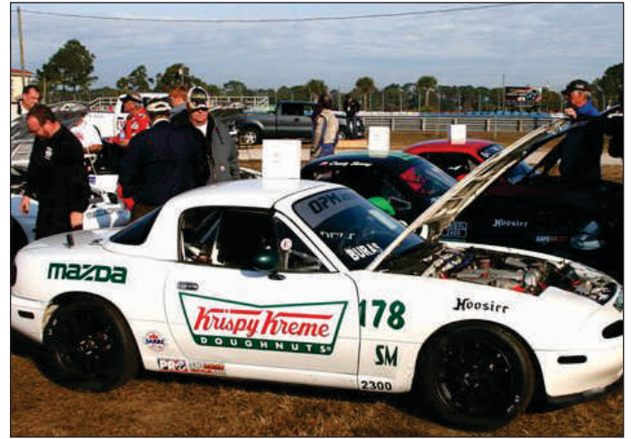
The Topeka Compliance Crew at work