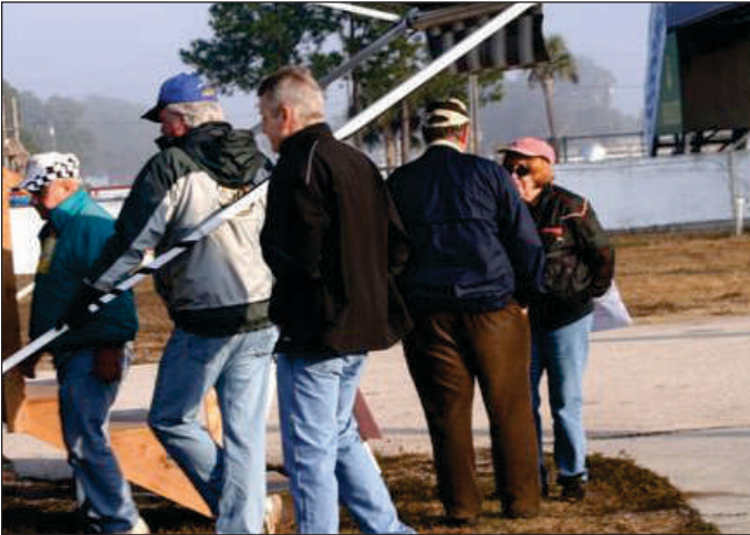
Waiting for the fog to lift Friday AM