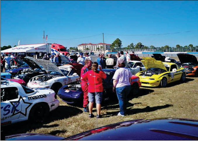
Spec Miata Post Race Impound