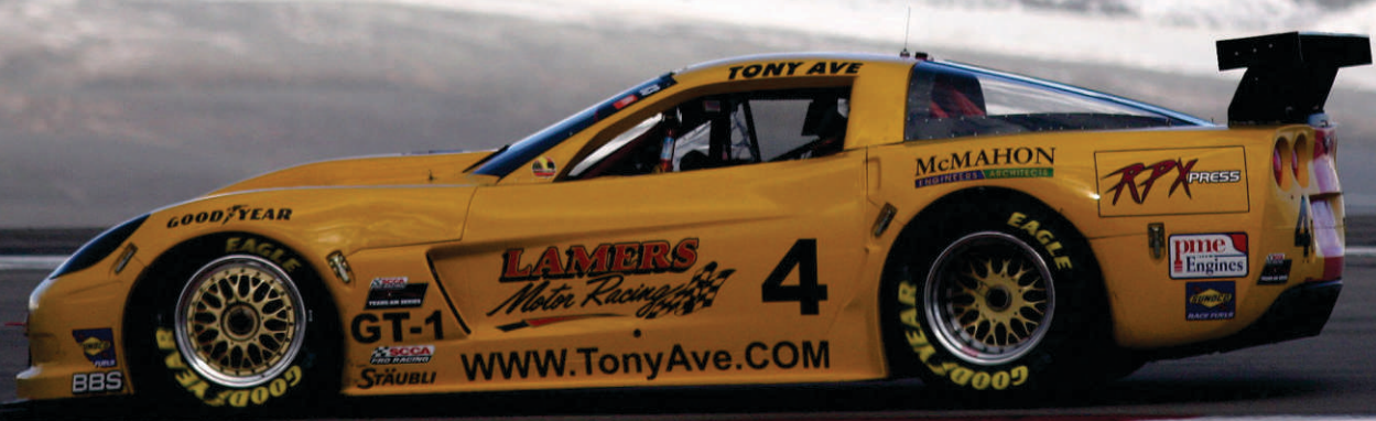
Tony Ave 2011 SCCA Pro Racing Trans-Am Champion