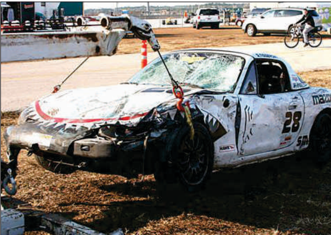
One of the victims of the 17A incident