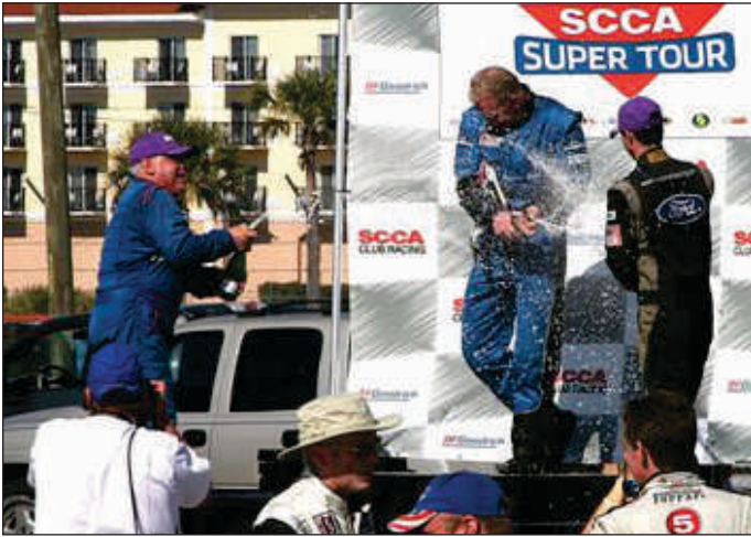
It looks like a conspiracy to drown the winner