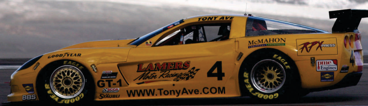
Tony Ave - 2011 SCCA Pro Racing Trans-Am Champion