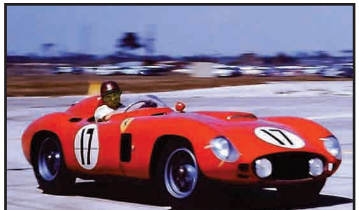
Juan Fangio in winning Ferrari