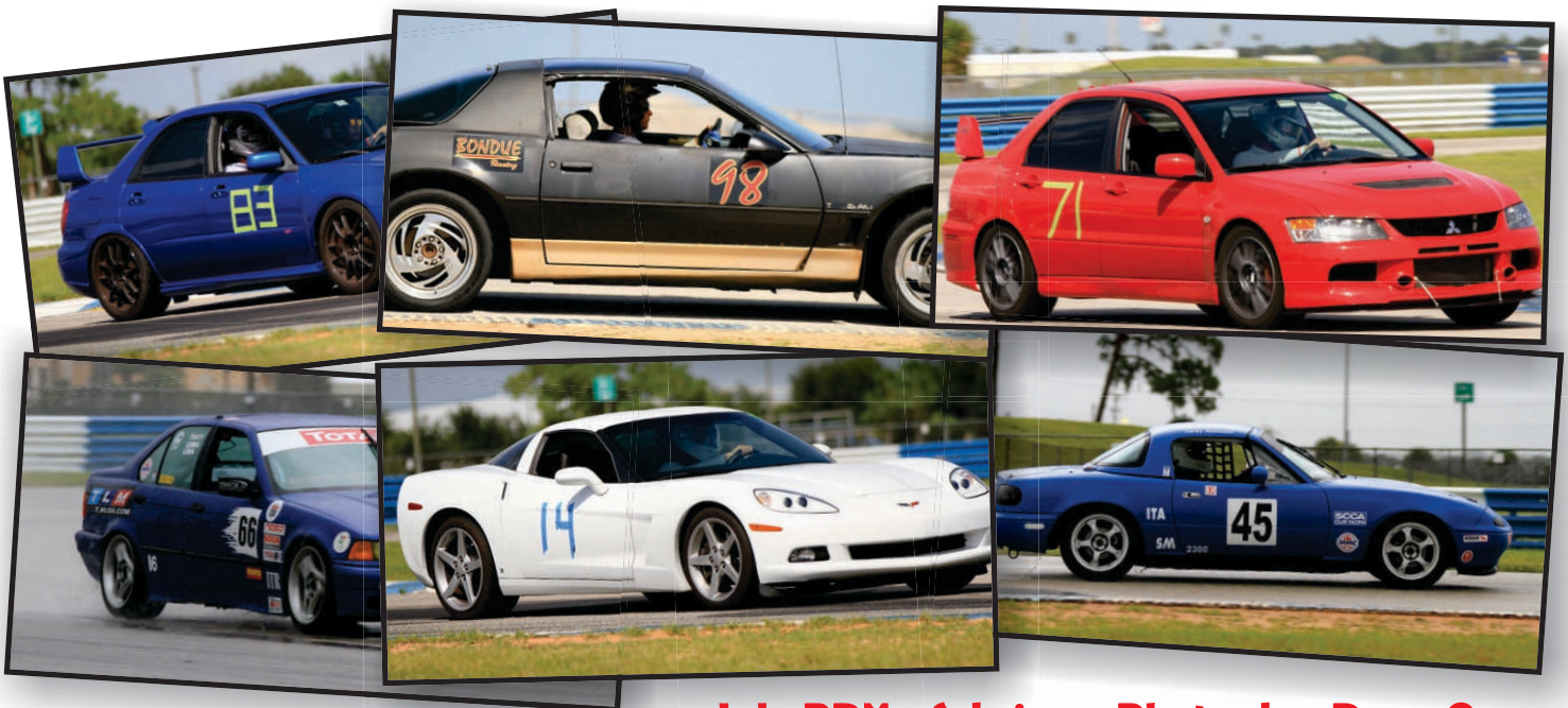
July PDX - Sebring