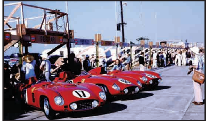
Factory Ferrari team at Sebring