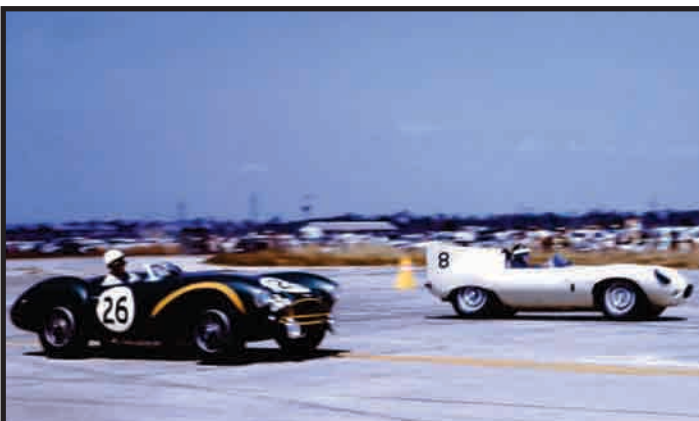
Moss's Aston-Martin vs Hawthorn's D-Jag