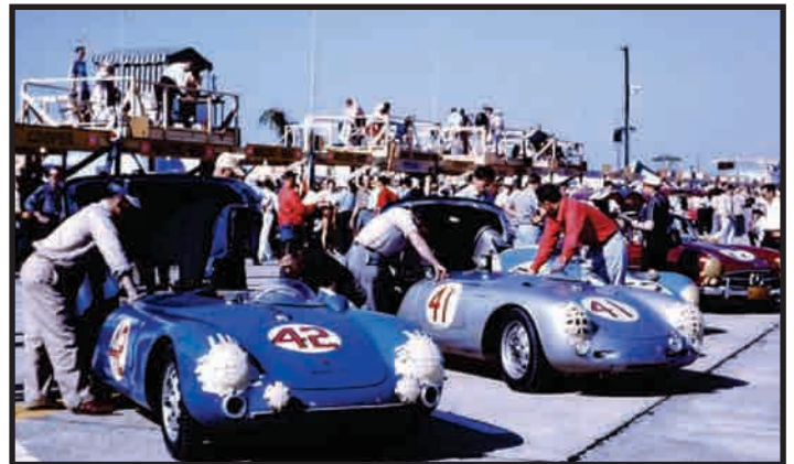
The Porsche factory entries