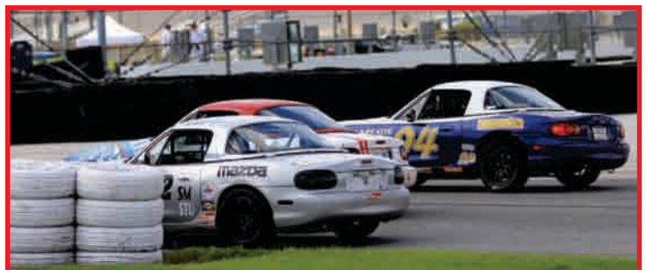
3 wide going into 1 never works out for someone