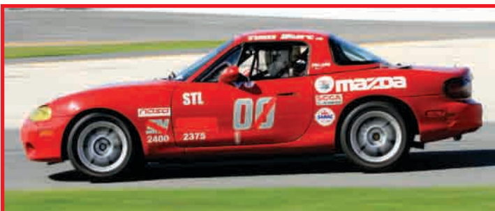
Thomas Burt STL record just under 2 21