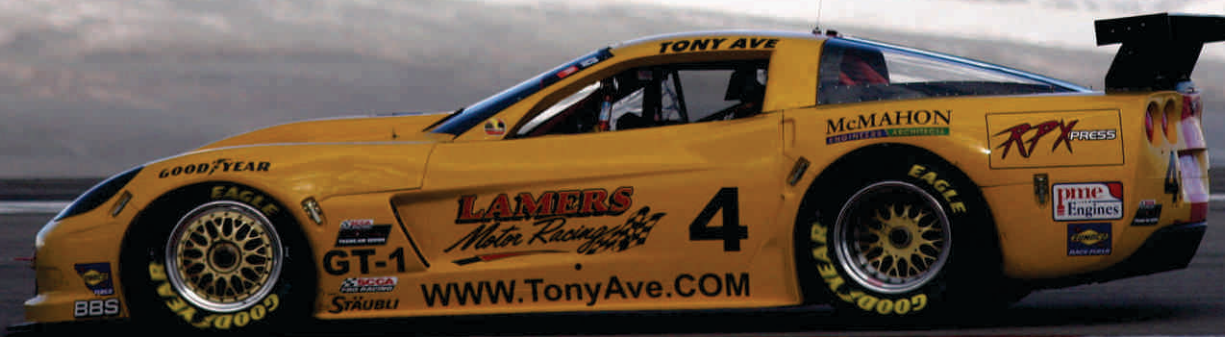
Tony Ave - 2011 SCCA Pro Racing Trans-Am Champion