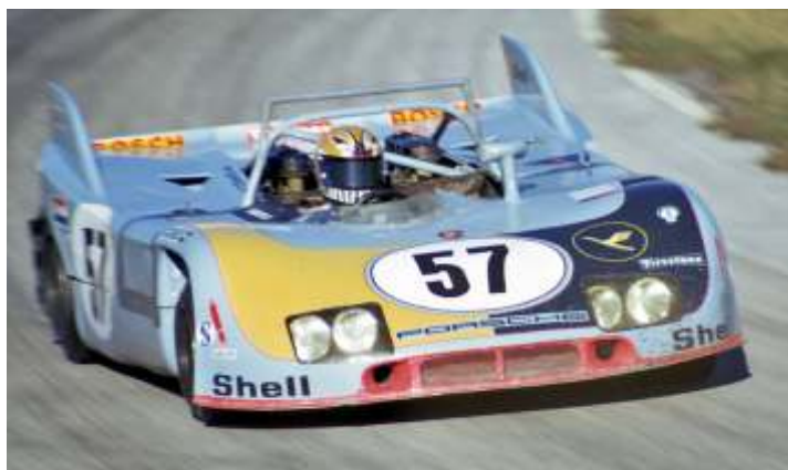
The Reinhold Joest Porsche 908/03 leaving the infield and entering the high banks. The car suffered a variety of problems including a fire during qualifying.