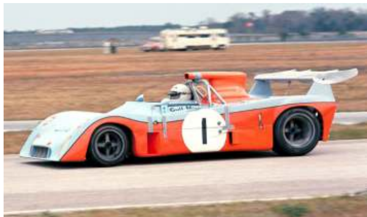
Howden Ganley drives the Gulf Mirage M6 Ford that captured the pole position. It led going into the first lap of the race but almost immediately began to suffer a variety of mechanical ills. It was a DNF.

based Porsche but it would not be the last. Gregg and Haywood would go on to win Sebring six weeks later in a 911, and 911 series cars would dominate sports car racing for a decade.