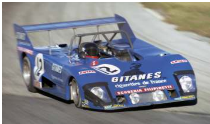
The Lola T282 of Reine Wisell, Jean-Louis Lafosse (seen in photo) and Hugues de Fierlant. The car retired after 281 laps with ignition problems.