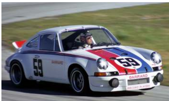
Hurley Haywood at the wheel of the Brumos Porsche 911 Carrera RS he and Peter Gregg drove to an overall win at Daytona in 1973.