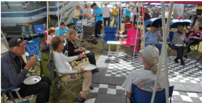
Lunch is served