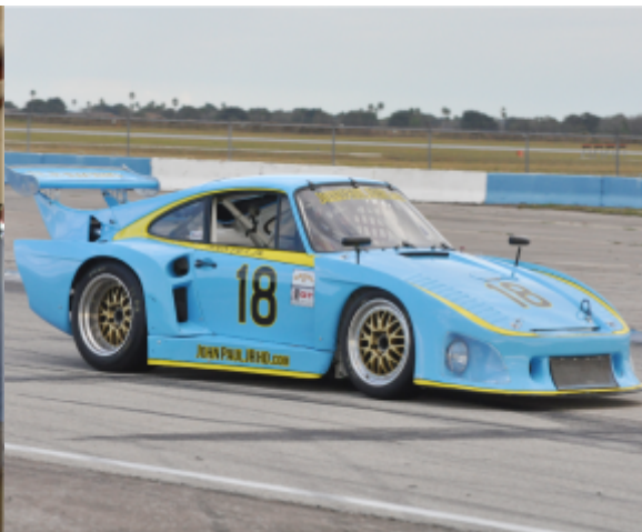
John Paul Jr. Tribute Porsche