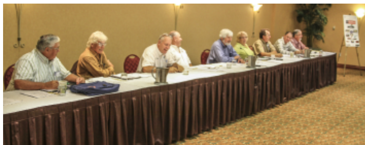
BOG "hard at work..."