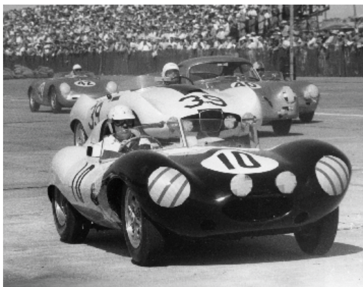
The start of the 1957 Sebring 12 Hour shows a Jag D-type, an Arnolt-Bristol Bolide, a Porsche 356A and a Porsche 550 RS. Only the Porsche 356A finished and in 31st position.