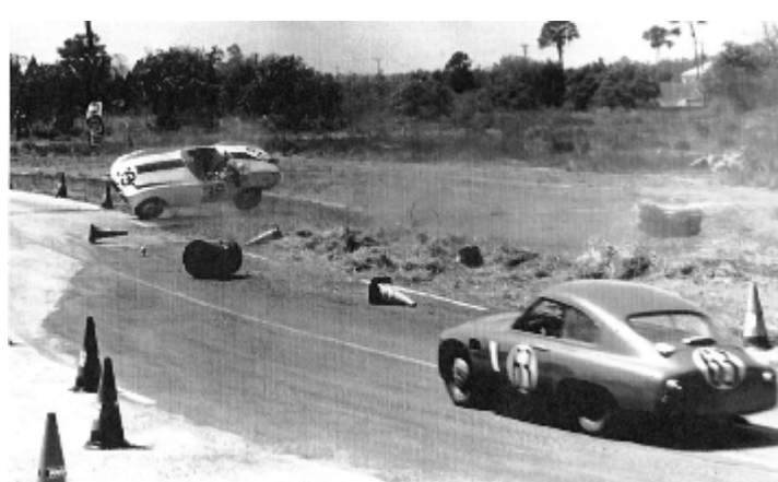
Goldich's car begins the fatal flip.