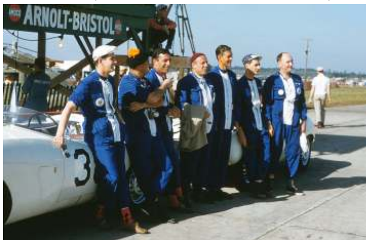
Team Arnolt at Sebring 1957.