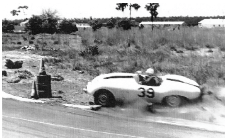
Goldich's #39 Arnolt-Bristol going off the track at the esses.