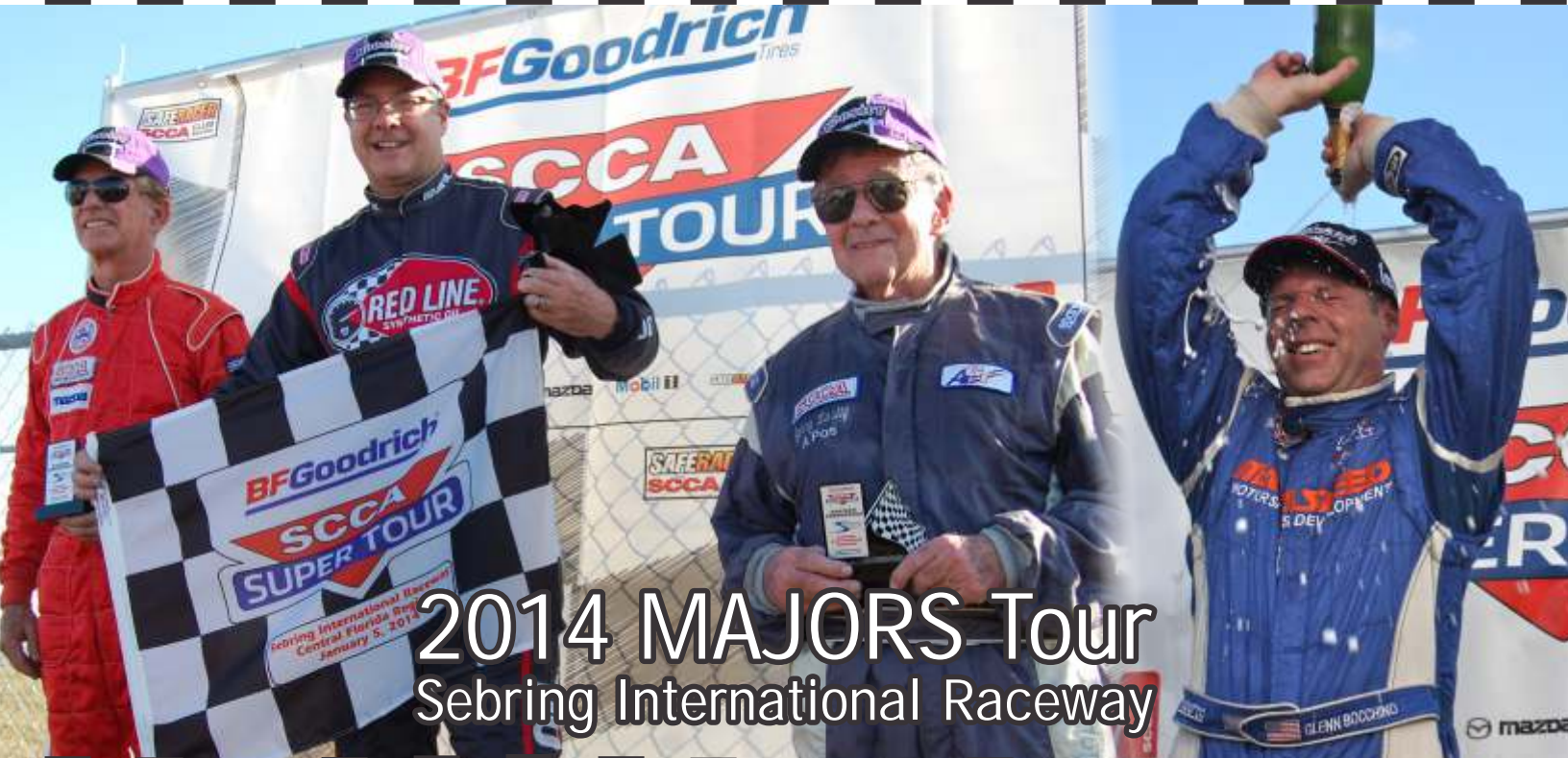
2014 MAJORS Tour Sebring International Raceway

Official Publication of the Central Florida Region Sports Car Club of America Volume 56, Issue 1 March 2014