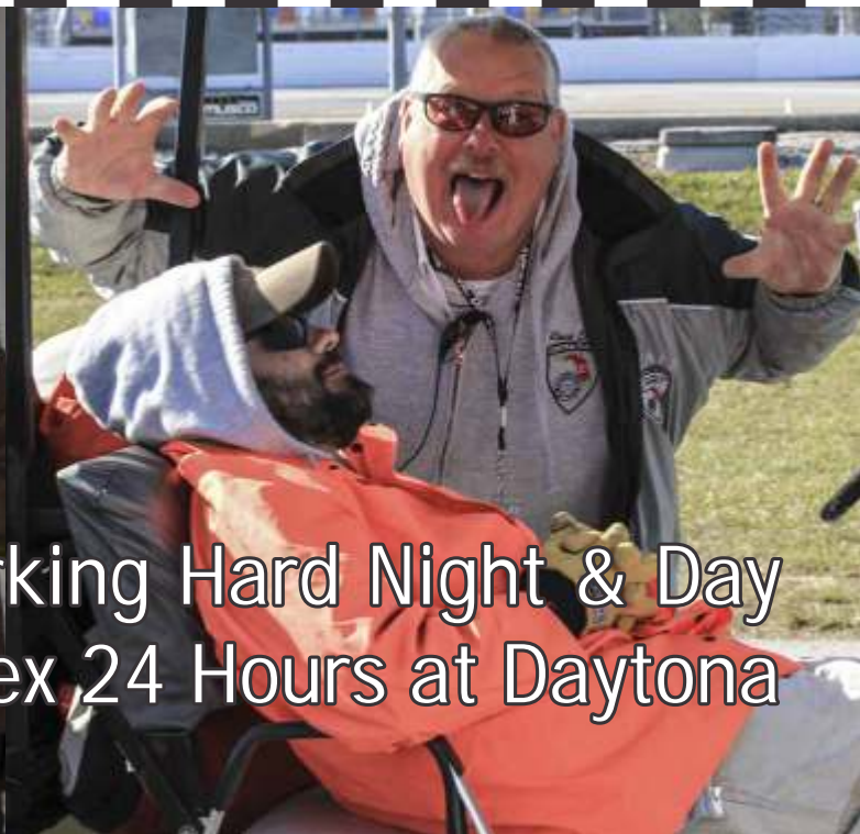
Working Hard Night & Day Rolex 24 Hours at Daytona