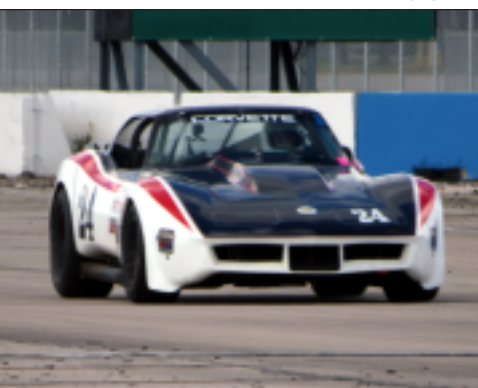
Roland Bauer, GT1