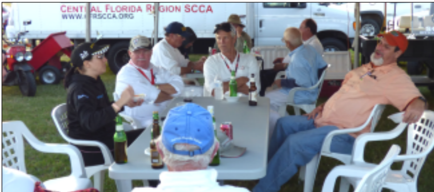
Bench racing at the Social