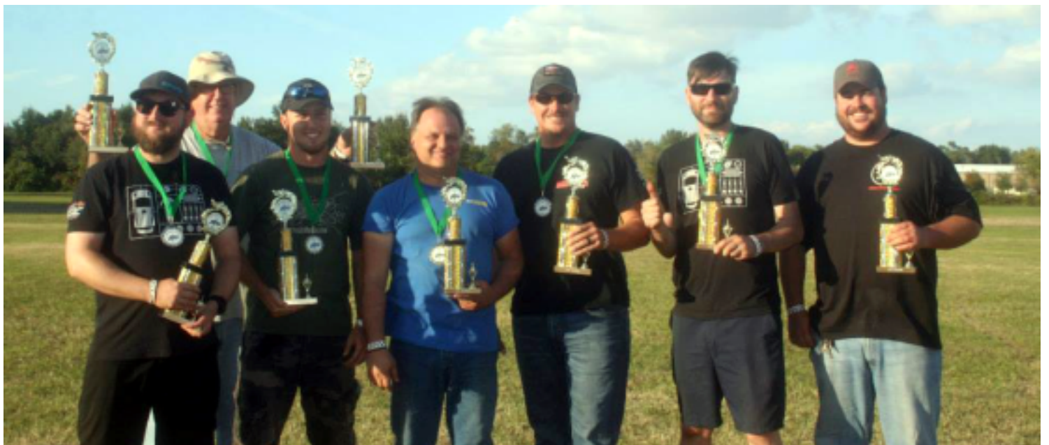
2014 RallyCross Points Champions