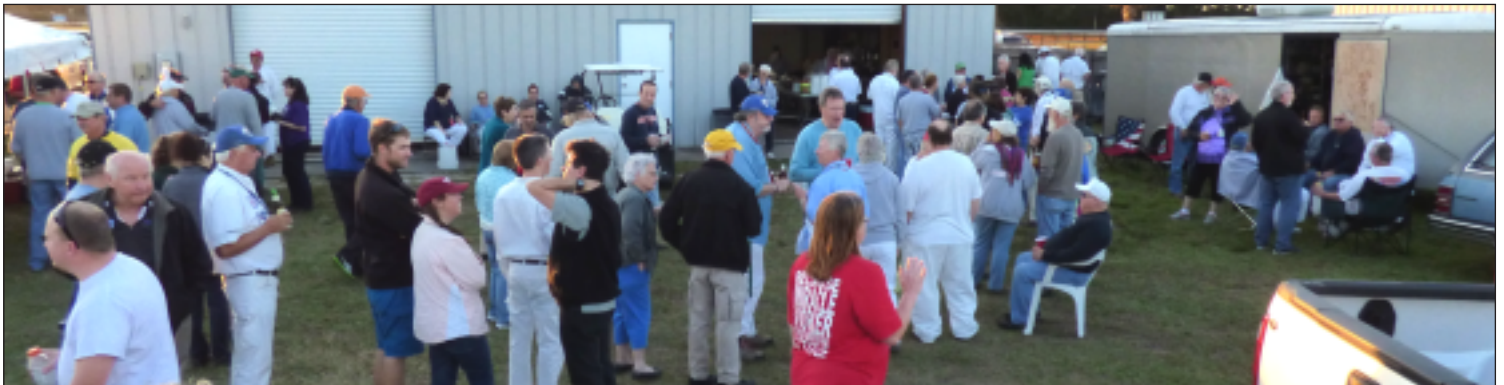
The line is forming and the feeding is about to begin...