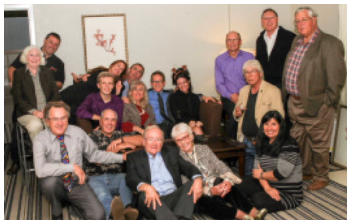
The "die hards" Saturday night in the Hospitality Suite