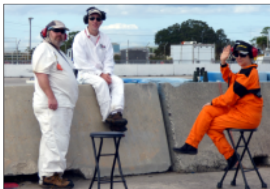
Turn 1 Sunday Afternoon