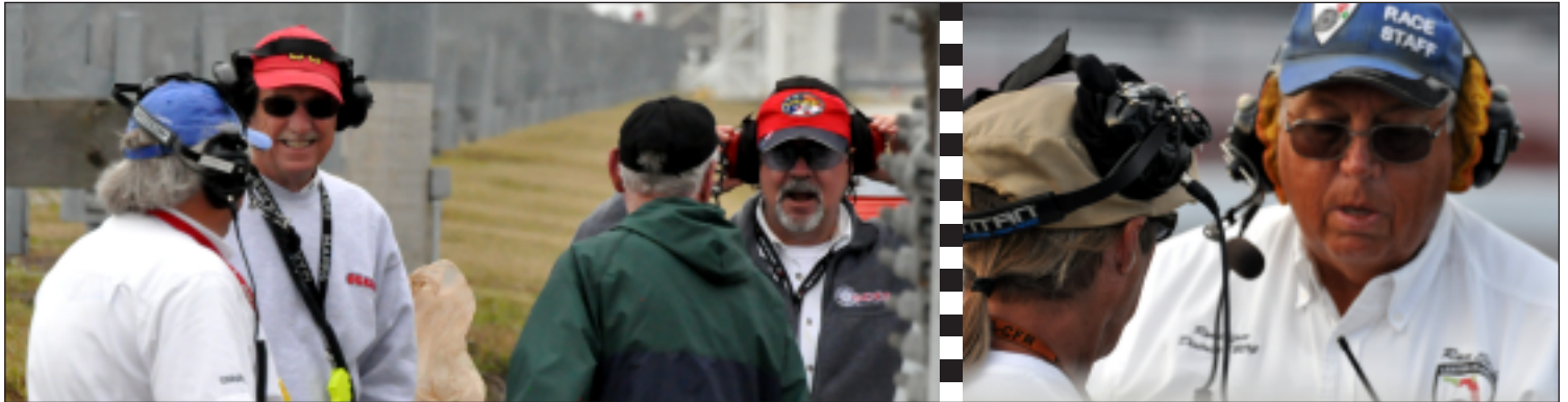
The Friendly Faces of the SCCA...