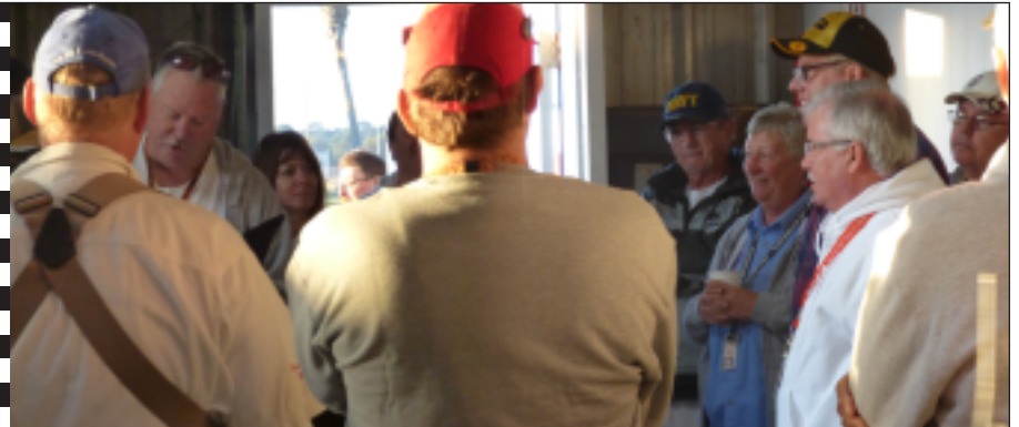
Worker Meeting Saturday Morning