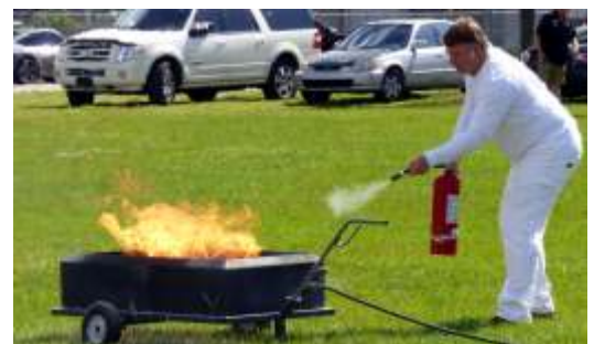
Propane pit used to train use of extinguisher... Good technique but fire bottle fails this one.