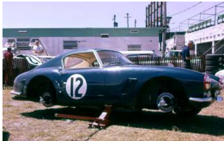
The recently deceased Denise McCluggage and Allen Eager finished 10th overall and first in class in this Ferrari 250 GT SWB. Most of her pit crew were volunteers recruited at the track.