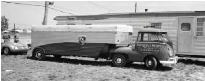
Porsche transporter at Sebring in 1961.