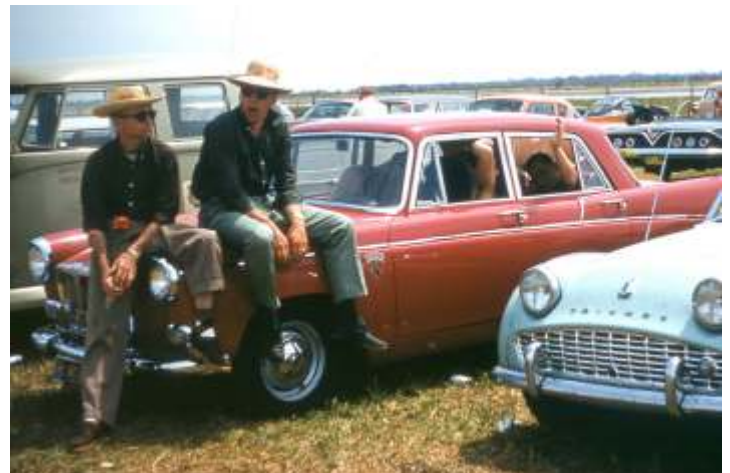
These gentlemen drove all the way down from the snowy North, slept in the car and scrounged fruit from nearby groves for nourishment.