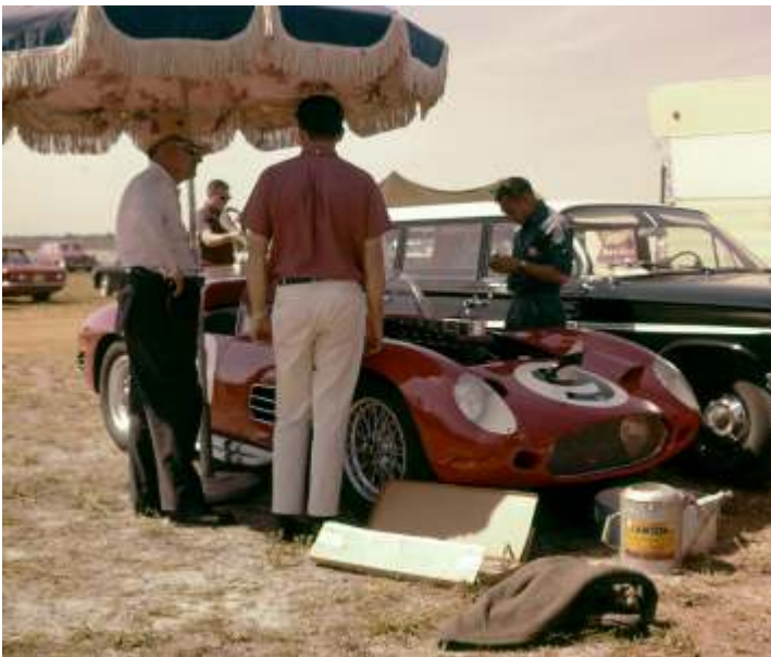
The Pete Lovely, Jack Nethercutt Ferrari 250 TR 59 in the paddock. Note no big trailer, tents, etc. The good old days.