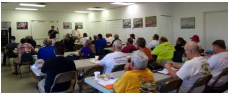
Worker school included classroom setting in the Skip Barber building.