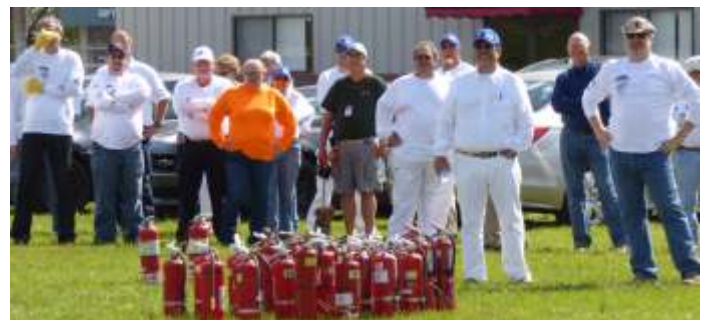
Students eagerly awaiting opportunity to demonstrate what they learned.