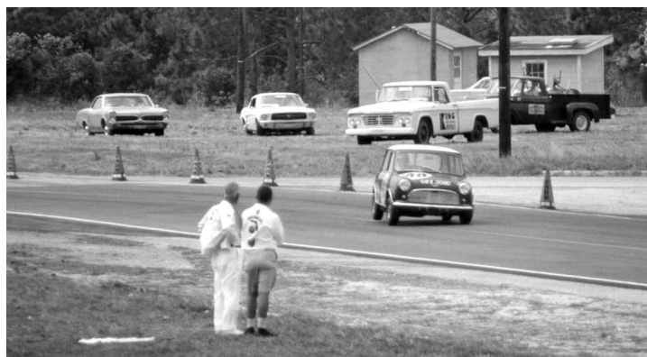
Two CFR members keeping an eye on that Mini as it tries to negotiate the Webster Turns. Yes those are flags on the ground and yes that fellow on the right is wearing shorts.