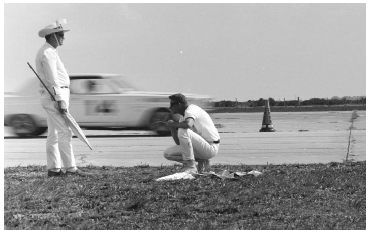
I think someone needs to take a break. Hopefully his relief is on the way.