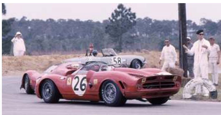
The infamous Hairpin Turn was always an exciting place to work. Note the only protection offered in 1966 was a hay bale