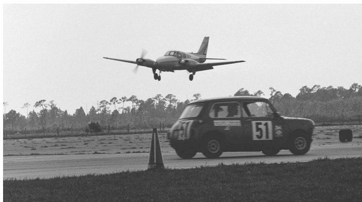
Is there a flag for this situation?