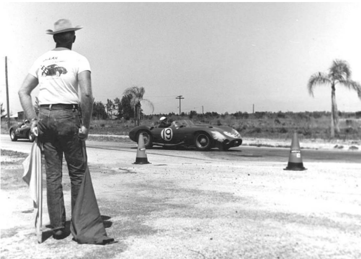
Sometimes one had to pull double duty as a blue flag marshal as well as a corner marshal. This photo is from the 1957 Sebring 12 Hours.