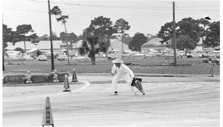
Going onto the track during the race was part of the job but you had to be quick. This is from the 1966 Sebring race.

With this article are some photos from the good old days of endurance racing at Sebring where CFR members got to be closer to the action than is permitted by most tracks today. Also, they were purely volunteers who did it for the love of the sport and most times the only compensation they received was a souvenir patch.