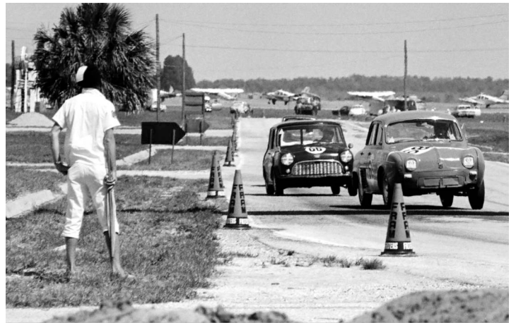
Capri pants and possibly sandals. What was he thinking?