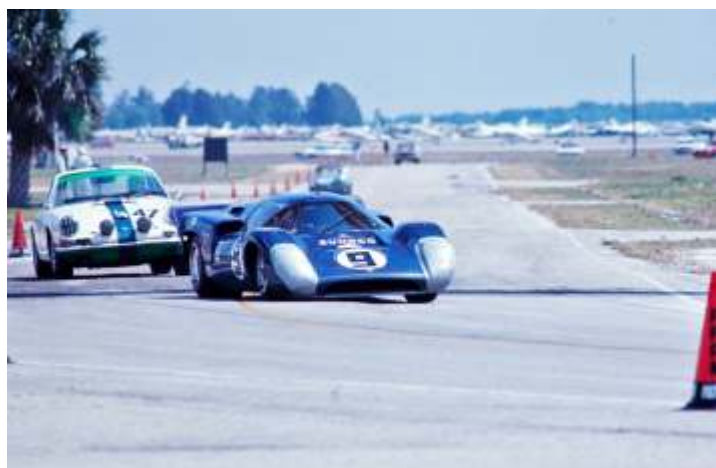
The Penske Lola T70 Mk.3B of Mark Donohue and Ronnie Bucknum about to enter the esses. This car won at Daytona in 1969 but the rough Sebring circuit resulted in a DNF for the Lola.