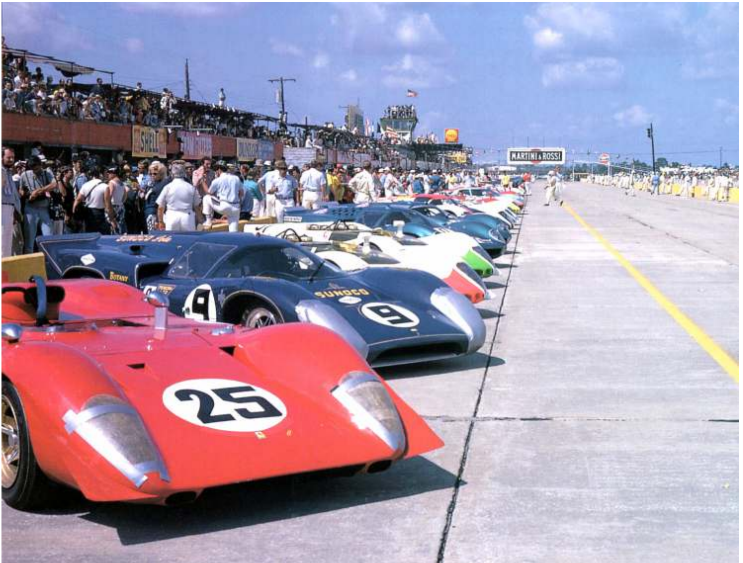
The starting grid for the last Le Mans style start at Sebring with the factory 312P on the pole and the Penske Lola second. After the race the Lola would be stolen when the Penske crew stopped in Ormond Beach while on the way back to the shops in Philadelphia. This prevented Penske from entering the car at Le Mans in 1969.

At one point the factory Ferrari 312P of Chris Amon and Mario Andretti held the lead but overheating began to plague them. Finally the steady driving of Jacky Ickx and Jackie Oliver (also known as the "pair of Jacks") brought their aging Gulf Ford GT40 up the ranks to take the overall win with the Amon/Andretti Ferrari very close behind.