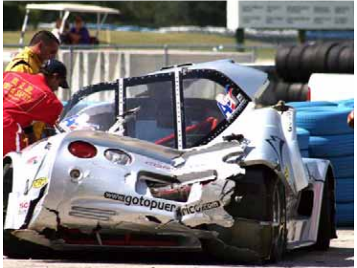
Kristian Skavnes suffered a rude introduction to Turn 17's wall.