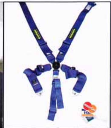
Distributors of Schroth harnessbelts for street and race applications

Formula Mazda rentals for regional or national races!