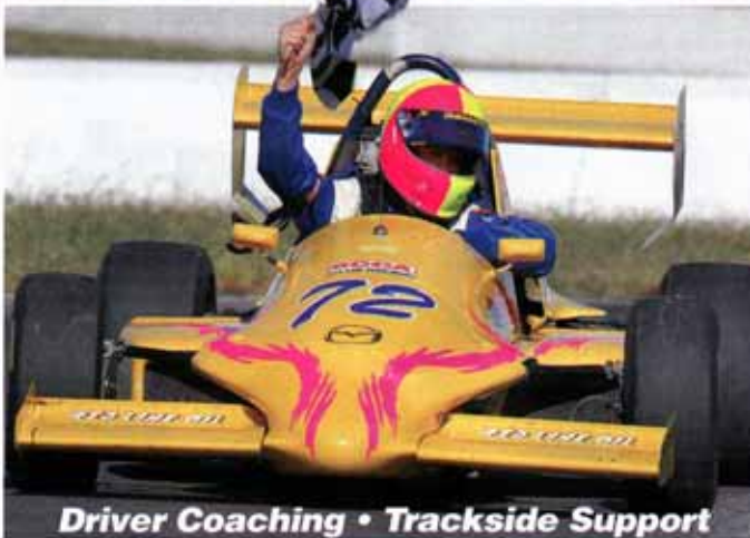
Driver Coaching • Trackside Support