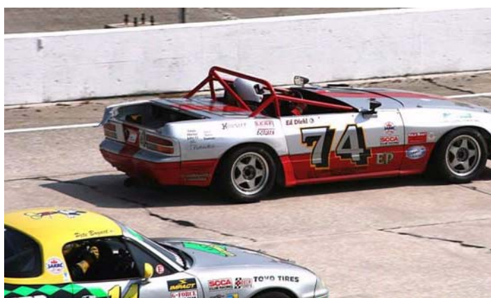
Ed Diehl was doing well until the wall stepped out and hit him