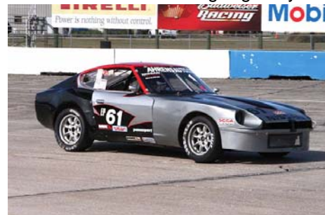
If this Guy wanted to add his initial, he'd have to get a bigger car.