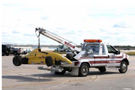
Nick Hollingshead Race ended early with a Turn 1 visit to the wall.