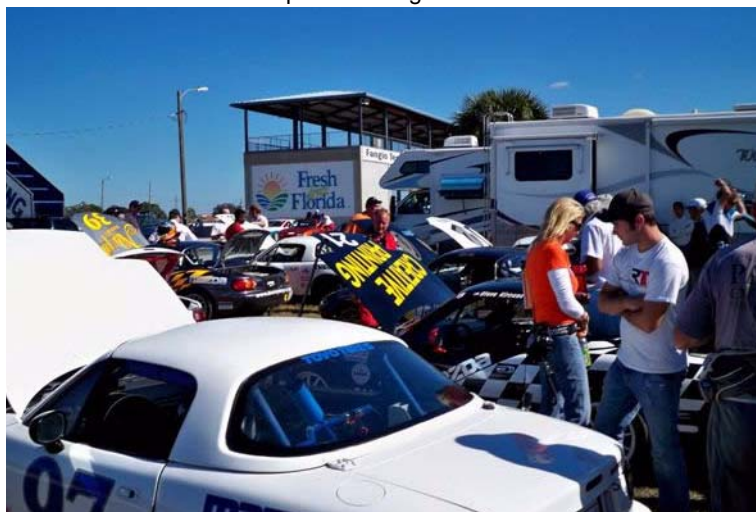
The Entire SM Field Was Impounded - Again.