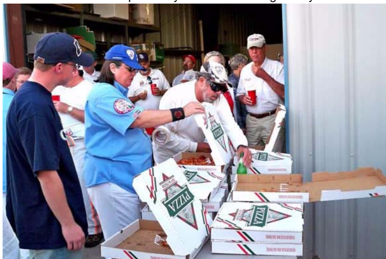
The Usual Social Accompanied By the Usual Feeding Frenzy.