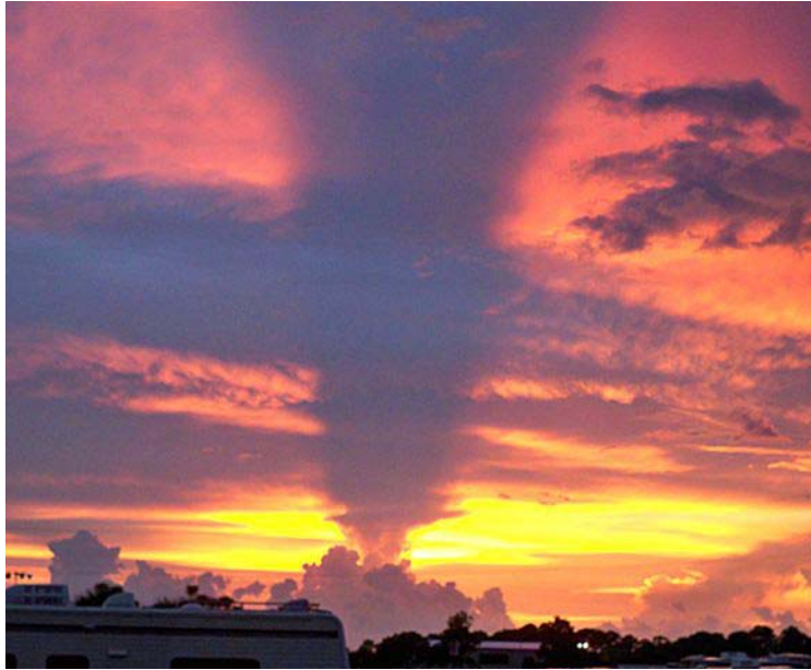
Just another one of those spectacular Sebring Sunsets