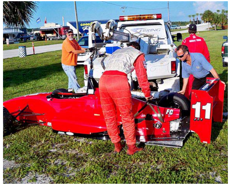
Results of the Tangle in Turn 17A