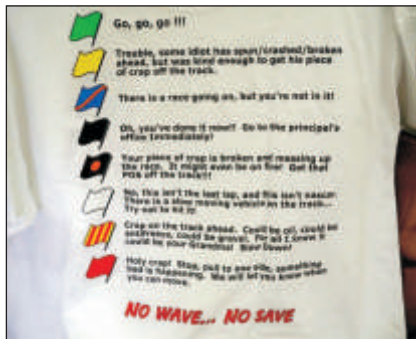
Finally, Flagging explained.