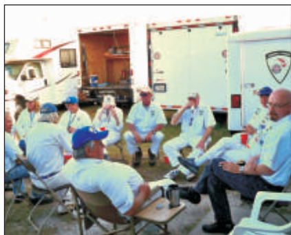
Happy Hour on Friday evening.