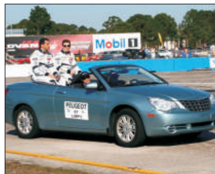
The Peugeot Drivers on their parade lap.