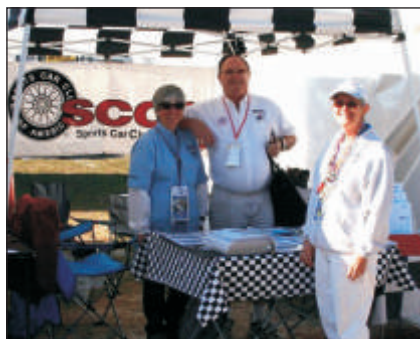
The CFR Membership Booth, 2010 edition.