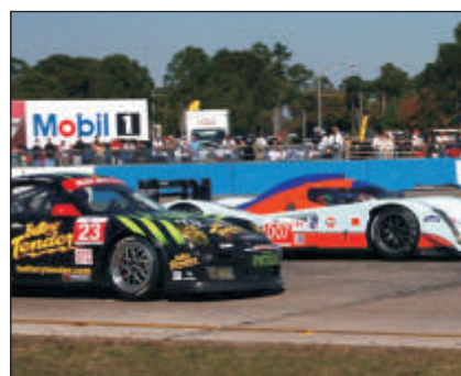
Close racing in Turn 17A as the Aston Martin passes a GT car.