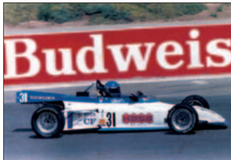
My Hasa Club Formula Ford Merlyn Mk. 30. at Riverside, 1988.