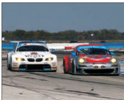
One of the Rahal Letterman BMWs and a Flying Lizard Porsche in Turn 15.