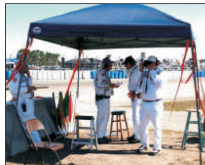
The Turn 17A Crew gets ready for 12 Hours of racing.