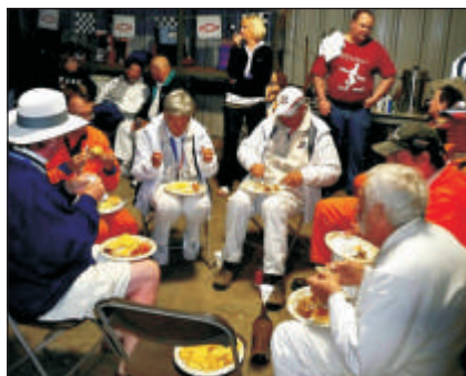
The Crew enjoyed a little "midnight snack" courtesy of IMSA.