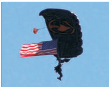
The traditional parachute drop presenting the colors.