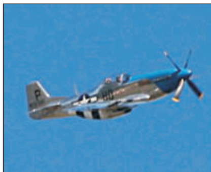
This year's flyby was a WWII P-51D Mustang in D-Day markings.