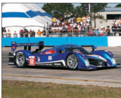
The Bourdais Peugeot 908 HDi FAP eventually 2nd overall.