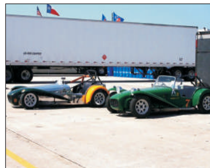
From the Vintage Group, a good looking pair of Lotus Super 7s.