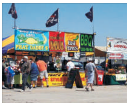
As usual, the Midway was in full flair.