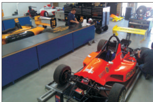
Stargate World's Garage, car on scales.