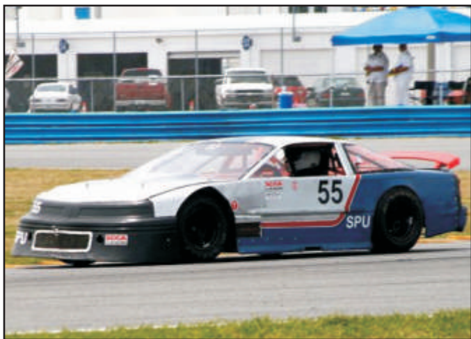
Terry Seay Under The Watchful Eye Of The Turn 1 Corner Crew