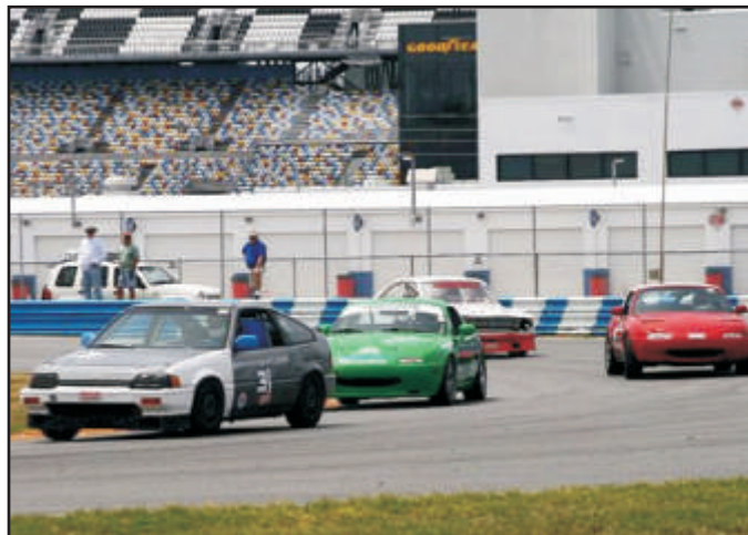
A Pack Is Watched Closely By The Instructors In Turn 1