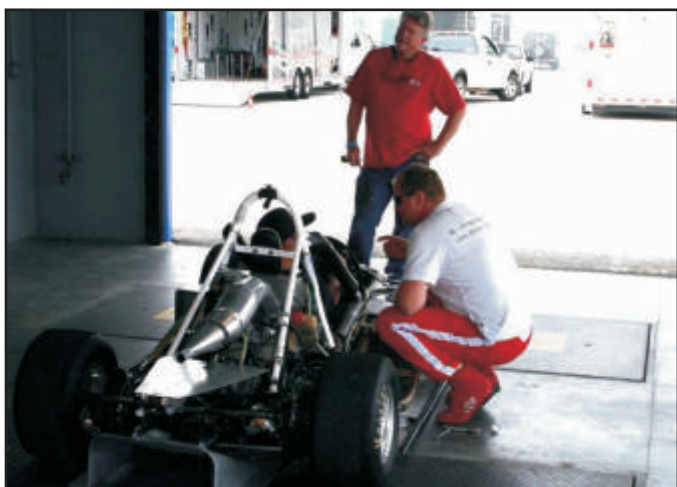
Daytona's Scales Are Good For Adjusting Corner Weights