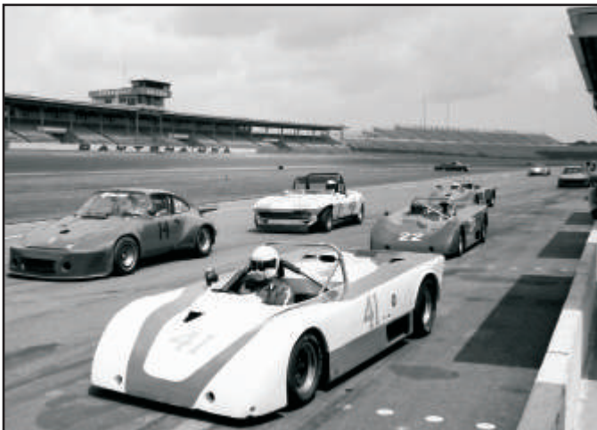
Daytona Reg Nat A