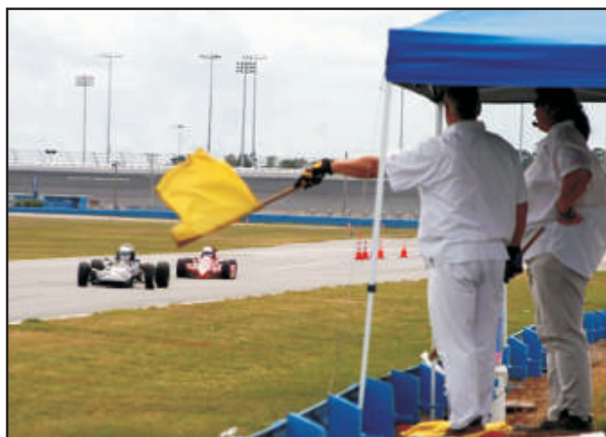
One Of Many Yellow Flags From The Turn 1 Crew