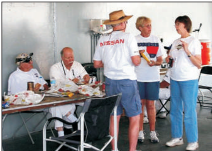
Fine Dining ala Subway