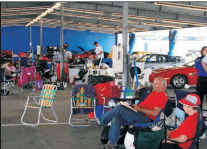
Garage Area Between Sessions