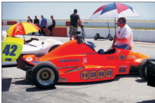
Pre-Grid for Race #2 on Sunday