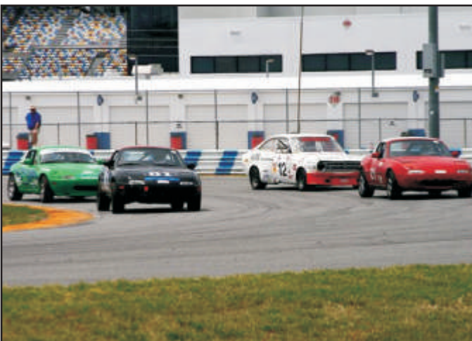
Turn 1 Offered The Choice of Many Different Lines