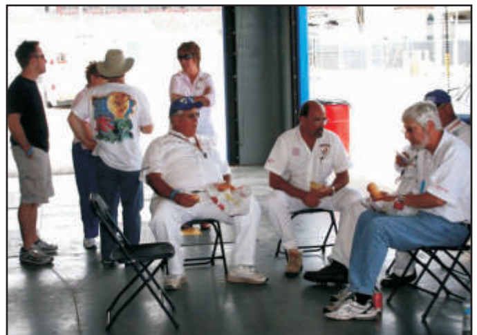
Lunch In The Tech Area