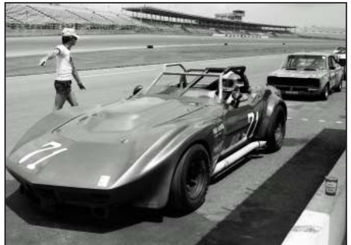
Daytona Reg Nat B