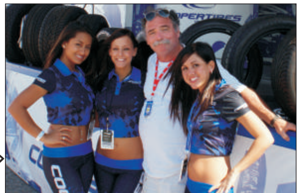
The girls never ever leave me alone