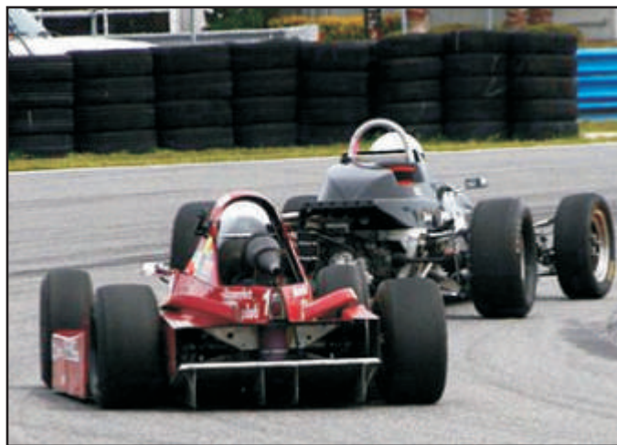
Two Open Wheel Students Head For The Kink