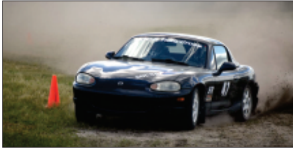
Cody Maitland • Stock Rear Wheel Drive 1999 Mazda Miata • 10th Overall

A full list of competitors and results can be found at: https://cfrrallycross.blogspot.com .