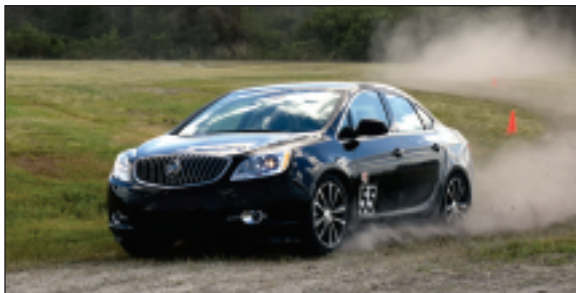
Travis Ouellette • Stock Front Wheel Drive 2016 Buick Verano • 8th Overall