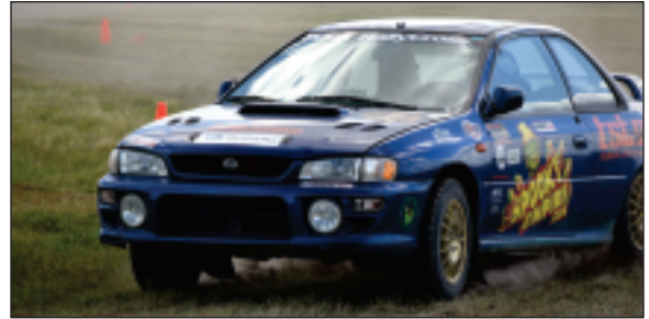
Alan Rodriguez • Prepared All Wheel Drive 1995 Subaru Impreza • 1st Overall