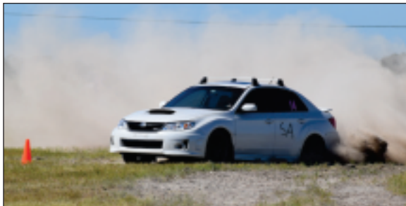
Kyle Daley • Stock All Wheel Drive 2014 Subaru WRX • 16th Overall