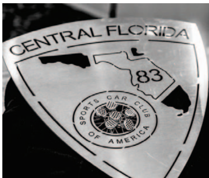
One of the many items available for the Silent Auction, a custom laser cut stainless steel CFR Logo.

background and shared his passion for racing and helping at risk youth.